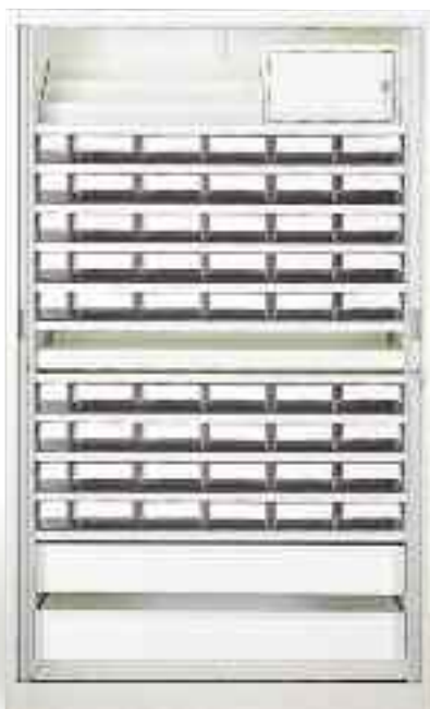
Long stay cupboard for personalised management of 45 residents