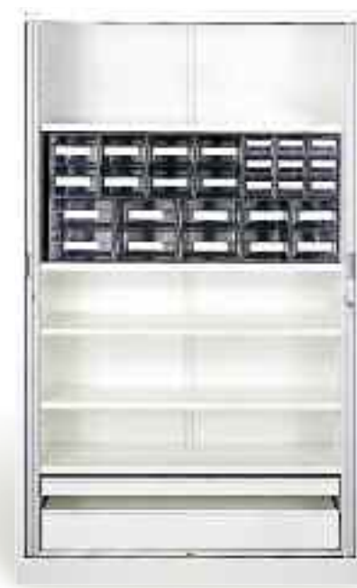
Cupboard for medical supplies