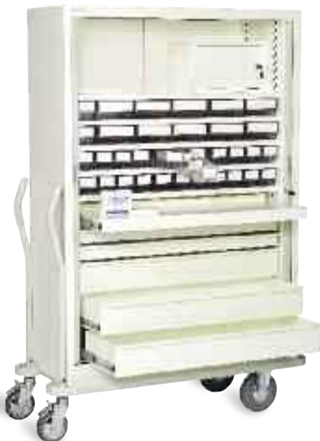
Mobile transfer cupboard

PraticDose® puts its technical support at your service to help you determine your ideal layout using computerised simulations.