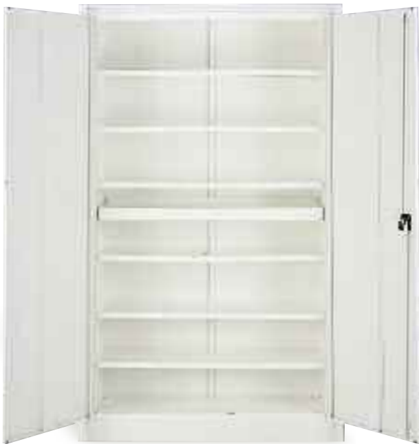
Double door cupboard